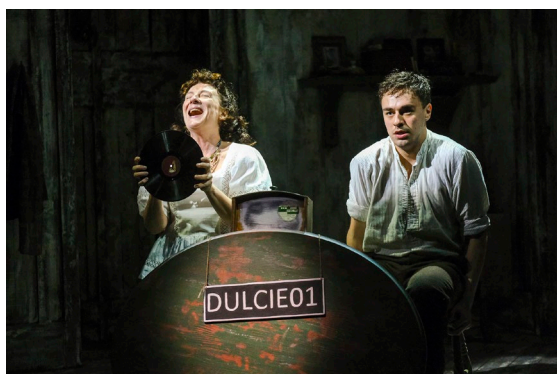
The Offing