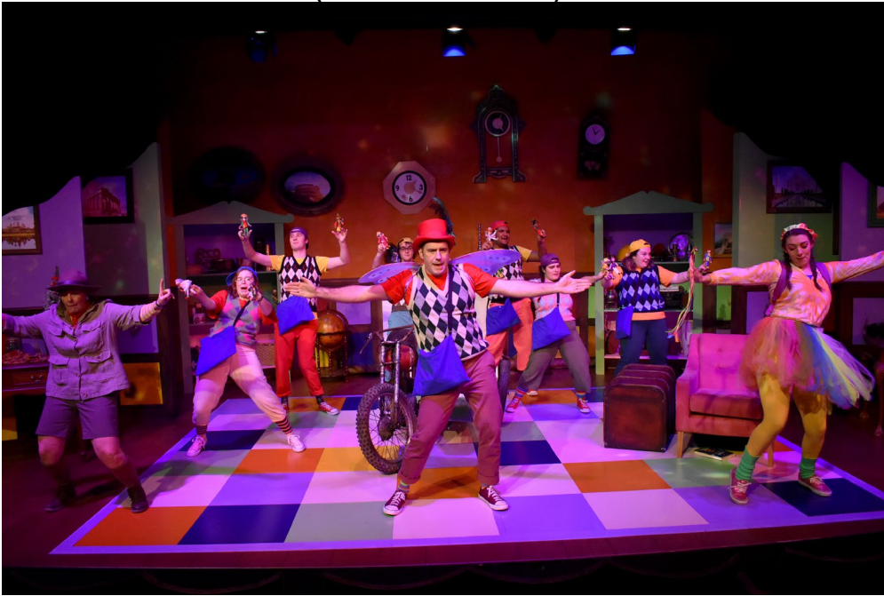
The Giant Who Had It All.

We've been delighted this year to welcome the very talented BA (Hons) Acting Year Three Acting students from Coventry University Scarborough into the building. They've been with us for the last few weeks rehearsing for our Christmas show for the fives-and-unders (although we guarantee it's great fun however old you are!), The Giant Who Had It All (And Then Lost It...) .