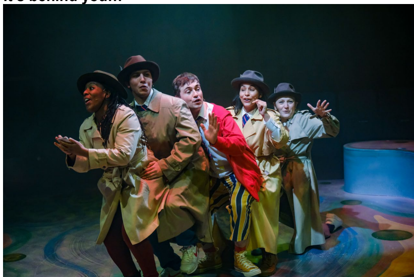
Jack and the Beanstalk

'Magical, festive, silly and bonkers' – that was the verdict of the Scarborough News on our Christmas show in the Round, Jack and the Beanstalk . If you want to see what they meant, take a look at our pictures... and if you haven't booked already, there's still time – it's on until New Year's Eve.