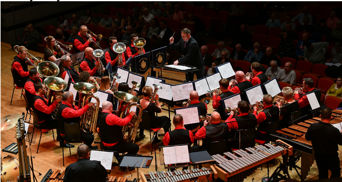
Hammonds Saltaire Band