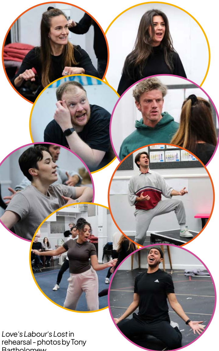
Love's Labour's Lost in rehearsal